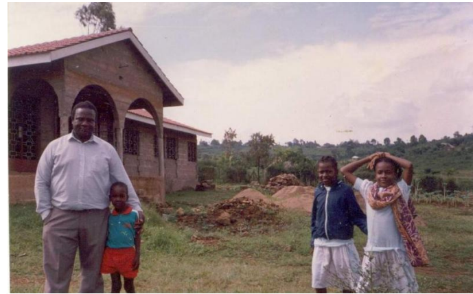
Dad at got house holding olende