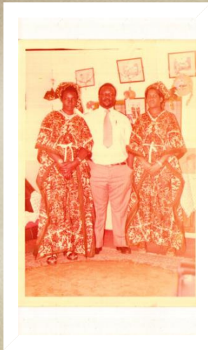
Mum1, Dad, Mum2