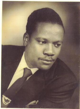
Handsome Dad in his youth